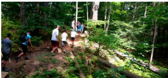
Westbrook Community Center Summer Camp Youth Volunteering.

In the future, while Mill Brook Preserve South is not currently connected to Mill Brook Preserve, it is our vision to create a corridor park that is connected both for wildlife and for people to enjoy for generations to come.