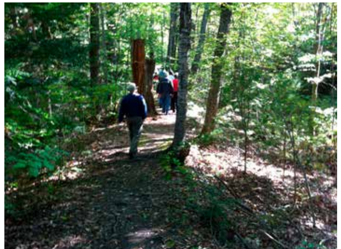
Gambo Preserve Tow Path.