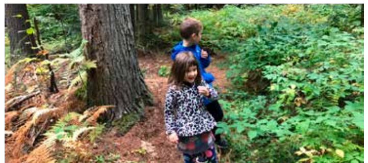
Next Generation Exploring Randall Orchards Trails.