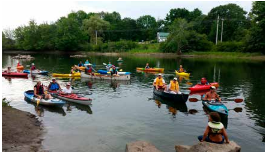
Paddle the Presumpscot event summer 2019.

February, Date TBD Hawkes Preserve, Gorham