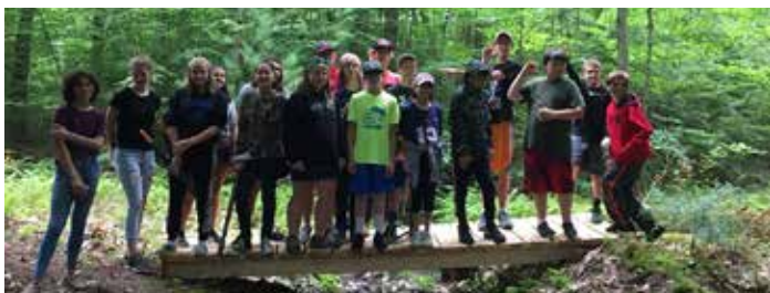
Standish Recreation Summer Camp Volunteers.

If you have not visited Randall Orchards recently, we hope you will make it this fall to pick apples and walk the new forest trail.