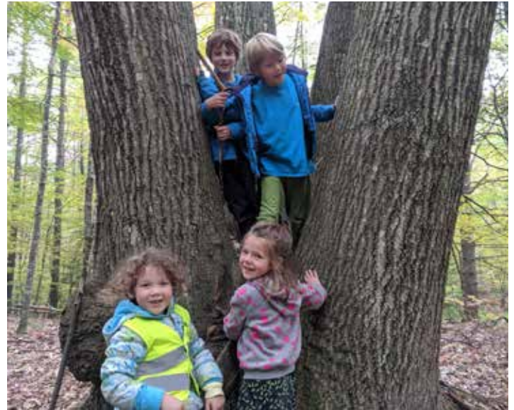
Kids exploring the giant Oak Tree at Mill Brook Preserve South.