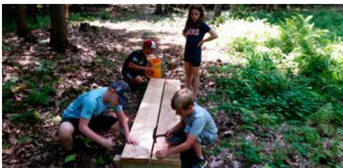
Standish Recreation Summer Camp Volunteers Building a Bridge.