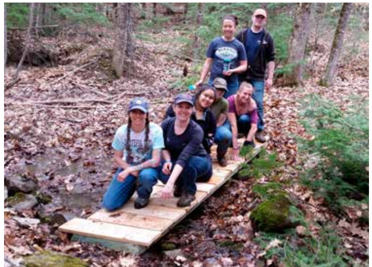
Volunteers from Sebago Brewing at Nelson Preserve.

Our success as a local community based-nonprofit is founded on active and engaged volunteers. We want to say a big thank you to the over 150 volunteers who helped our Land Trust this year, including water stewards, land stewards, trail builders, event supporters, office volunteers, committee members, and board members. We have more volunteer opportunities this fall: