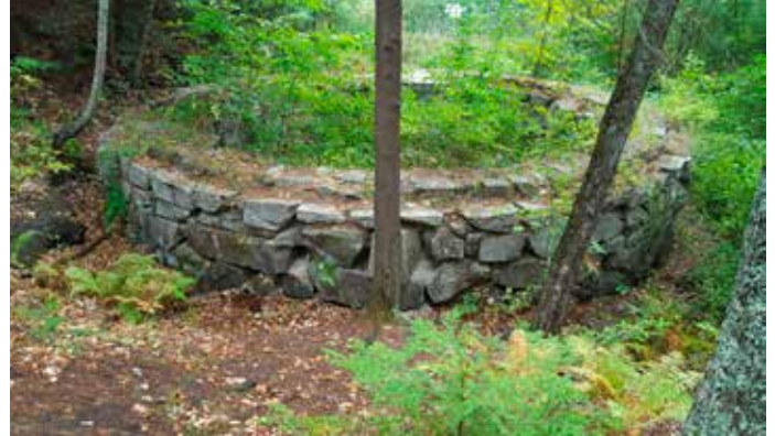
Gambo Preserve Mill Structure.

Work Consulted: Whitten, The Gunpowder Mills of Maine, 1990