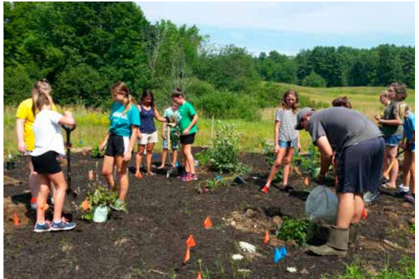
Windham Recreation Summer Camp Youth at Black Brook Preserve.