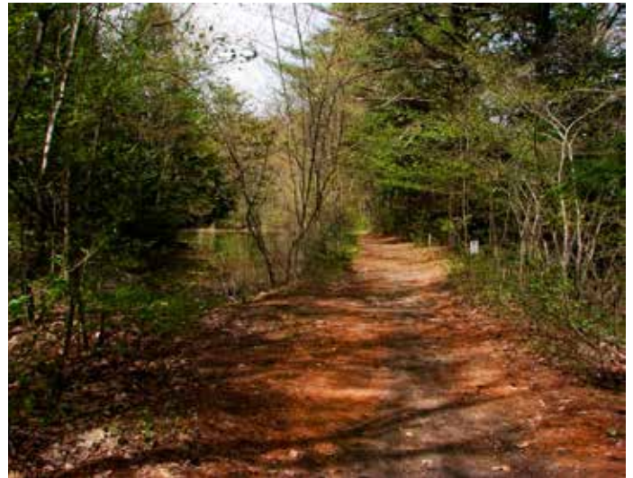
Hawkes Preserve Tow Path.